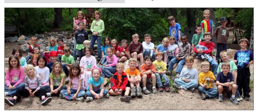
One out of every four campers (43 of 166) at the 2009 Myths and Magic session were 2nd-, 3rd- or 4th-generation Geneva Glen!

The awards during Knighthood include Silver Spurs and Roses, given to our staff Sir Knights and Ladies of the Glen. Alana